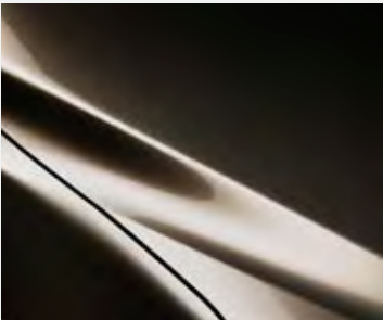
Titanium Flash Mica