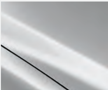
Sonic Silver Metallic