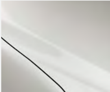
Arctic White Mica

Every Mazda is designed and built to the highest standards of performance and reliability. To give you further reassurance on how much we believe in our vehicles, our Mazda vehicles are backed up by a 3-year, Unlimited Kilometre Factory Warranty.