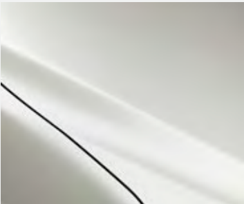
Snowflake White Pearl Mica