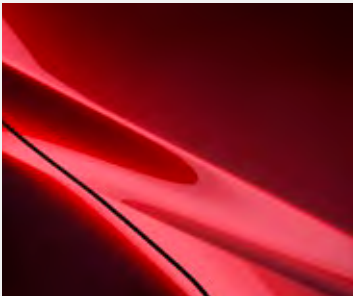
Soul Red Crystal