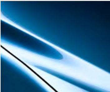
Eternal Blue Mica