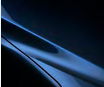
Deep Crystal Blue Mica