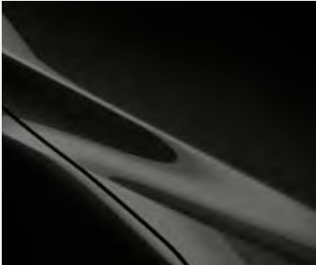
Jet Black Mica